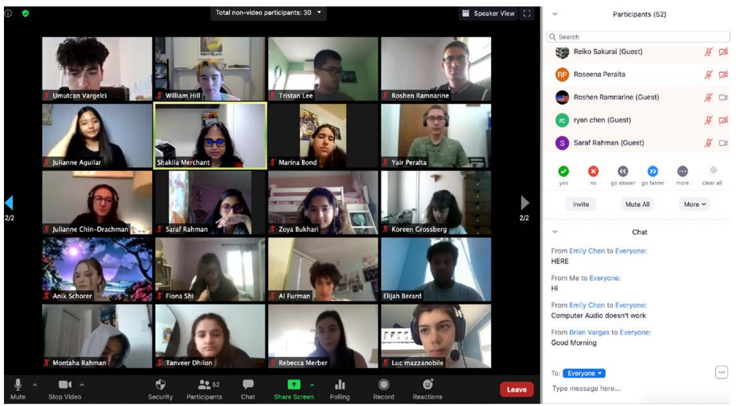
HIRES 2020 Orientation, June 29, 2020

Starting June 29, 2020, students were introduced to the program during a brief orientation session and also sat through mentor presentations on the research projects available to them to review and select based on their research interests. Each student received a form where they