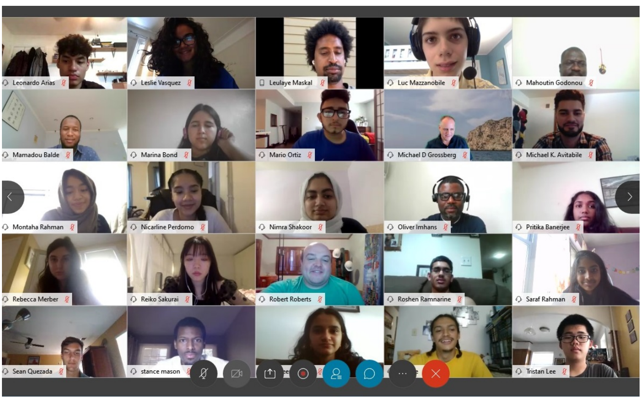
HIRES interns presenting during the Summer Research Symposium – August 10, 20